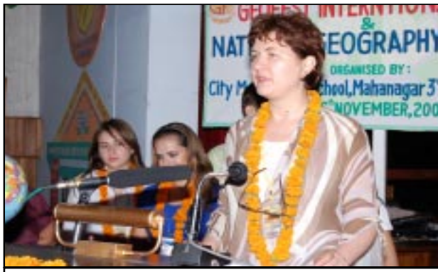
Students voiced their concern for a greener earth at Geofest 2007