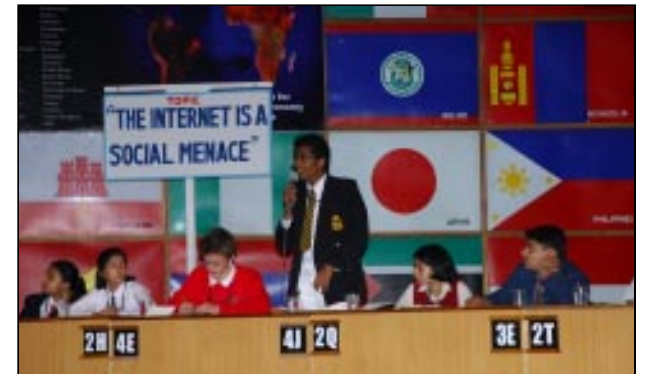
Debate was a thrilling experience at Quanta