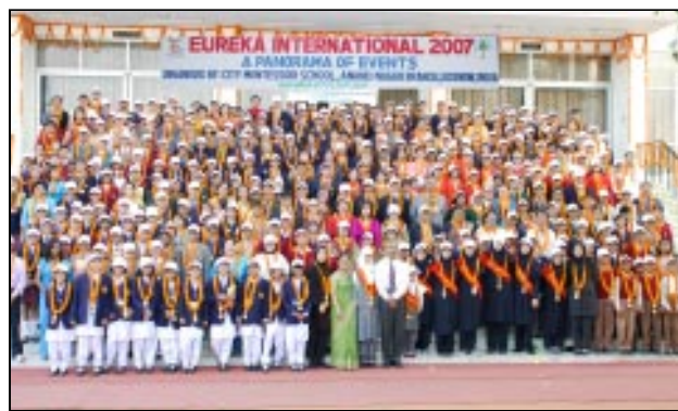
Participants of Eureka 2007 from India and abroad