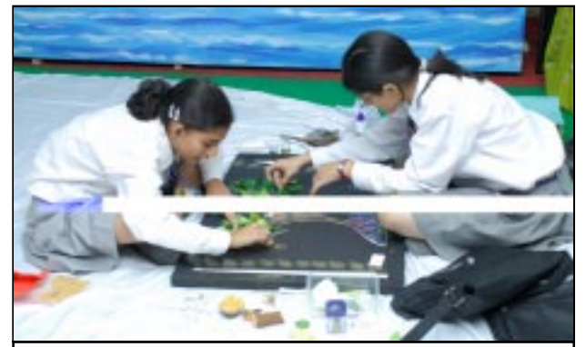
Paste Your Taste was an interesting contest for all