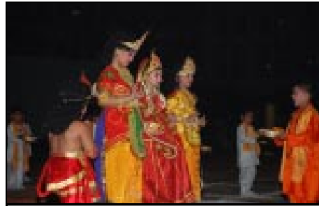
Students enacting a scene from Ramayana at the function

Parents were thrilled to see their talented wards create magic with their performance at the Annual Function organized by CMS, Gomti Nagar at the branch auditorium on 17 and 18 November. The entire auditorium reverberated with loud clapping as these talented students set the tune with their performances. Artistic presentation of cultural items by beautifully attired children enthralled the audience. The parents also eagerly participated eagerly in this programme boosting the morale of the students.