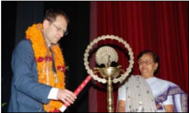
Dr Tom Verhoeff eminent mathematician from the Netherlands lighting the lamp at Quanta 2007

The five-day International Science Festival 'Quanta-2007' was organized by at CMS Kanpur Road auditorium from 13 to 17 November. Around 500 young scientists from 22 countries namely Bulgaria, Czech Republic, Democratic Republic of Congo, Finland, Germany, Greece, Jordan, Malaysia, Nepal, Netherlands, Nigeria, Pakistan, Poland, Portugal, Russia, South Africa, Sri Lanka, Turkey, Thailand, Ukraine, USA and various states of India participated with full zeal and enthusiasm in this festival and proved their scientific prowess and artistic talents.