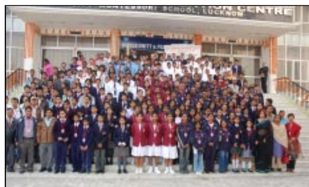
A group of participants of ICSQCC 2007

Quality Leadership is a process by which a person influences others to accomplish an objective and directs the organization in a way that makes it more cohesive and coherent. Leaders carry out this process by applying their leadership attributes such as beliefs, values, ethics, judiciousness, character, knowledge and skills.