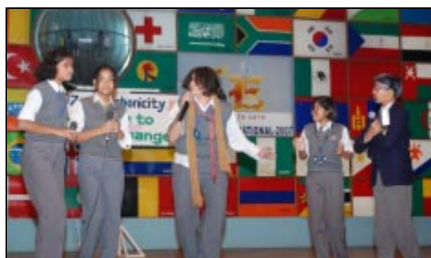
Zerocarbonicity contest taking place on stage

Success is not a destination that you ever reach. Success is the quality of your journey.